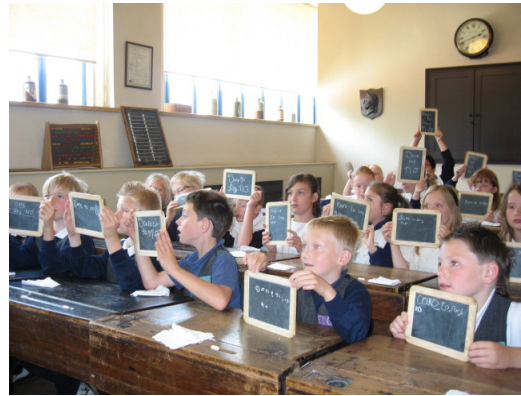
Learning the 'Victorian' Way!