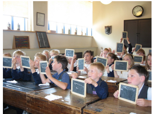
Learning the 'Victorian' Way!