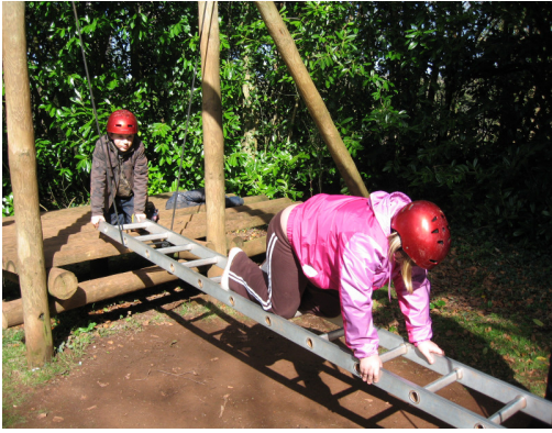
Team Building on Camp